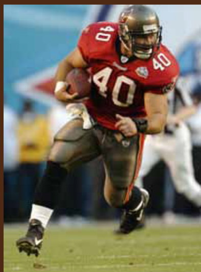
Mike Alstott '92 Purdue University Tampa Bay Buccaneers