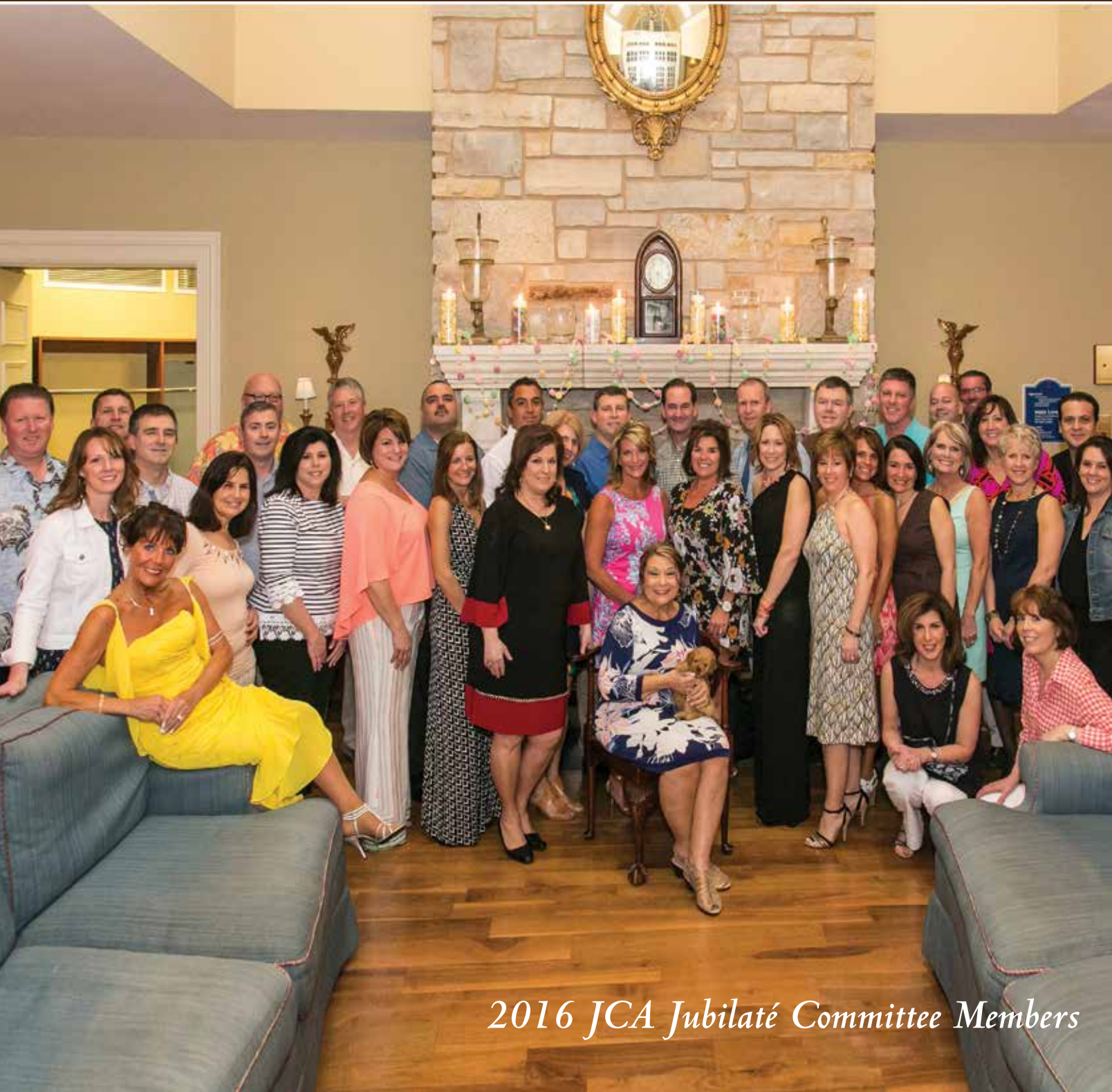
2016 JCA Jubilaté Committee Members